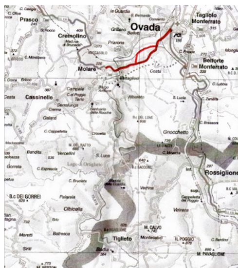
Map 1. Olbicella (coordinates 44°37'11"N 8°36'6"E) and the surrounding area